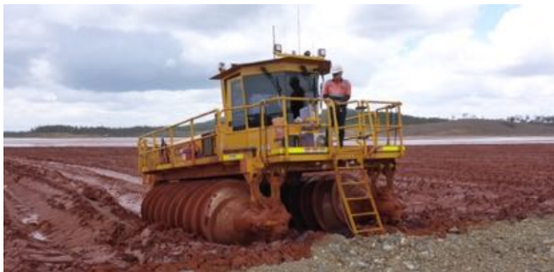
MudMaster® operations in bauxite residue

Phibion’s Accelerated Mechanical Consolidation Process (AMC) has been successfully applied to many alumina operations with a wide variety of bauxite characteristics and many different climatic regions.