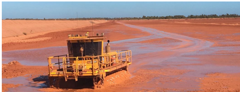
AMC operations in fine bauxite tailings (Note the water liberated from operations)

Phibion's Accelerated Mechanical Consolidation Process (AMC) has been successfully applied to bauxite mining operations to both reduce the volume of fine tailings and improve water recovery rates..